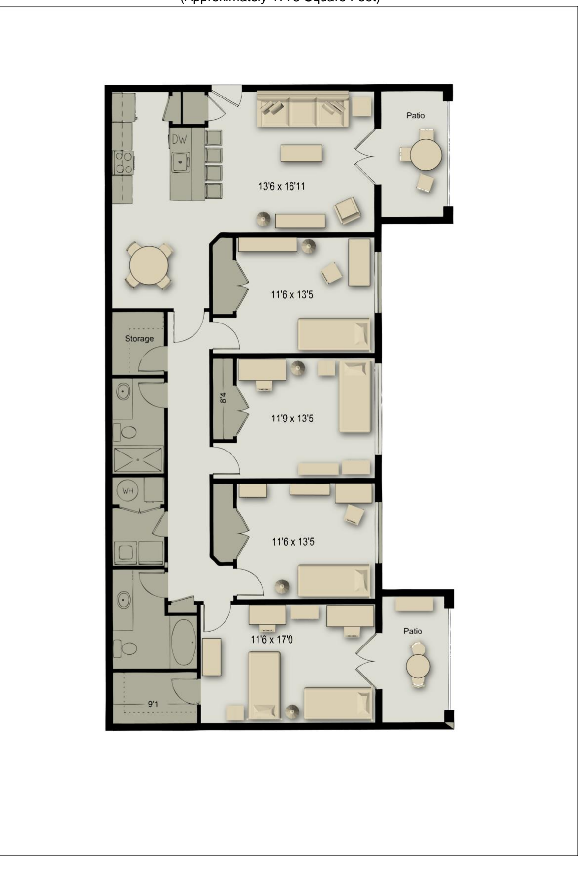
Floor Plan "A" (Approximately 1775 Square Feet)